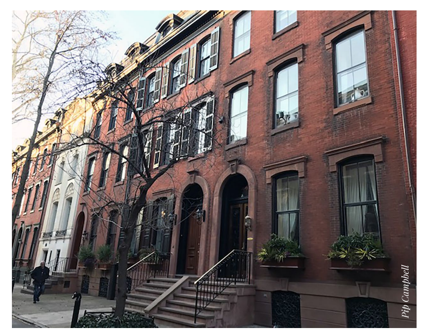
2000 block of Delancey.

Every effort each of us makes to retain or enhance the historic features of our properties, no matter how small, supports and increases property values—and who doesn't want their property to be worth more? Many studies and reports have been done by the U. S. Department of the Interior, the National Trust for Historic Preservation and other groups documenting the economic value of historic preservation not just for those designed by architects or lived in by famous people. Again and again, studies document the economic value of historically designated properties, but especially for those that are within a historically designated district. Remember that when you are improving your property in a way that respects its historic origins, you are not just doing this to have a nicer property or to be a preservationist, but to contribute to the economic value of our neighborhoods.