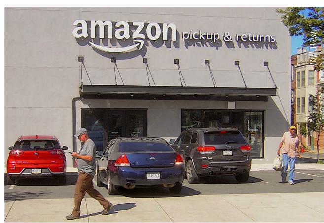
Take that, porch pirates! Amazon pickup center, 23rd & South.

Transportation planners like to talk about the last mile, but in Philadelphia the challenge is often the last 10 feet. Eventually a delivery vehicle has to stop and unload and deliver its cargo. In Philadelphia, this often means parking at the curb, and there is often no space at the curb.