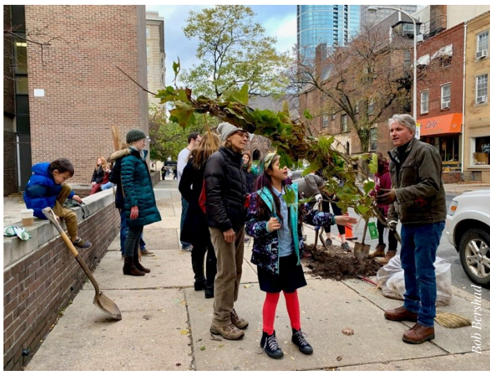
Sidewalk tree planting outside the playground

Learn more about becoming a <u>Tree Tender</u>. Learn more about Philadelphia's <u>green infrastructure plan</u>.