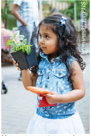
Youngsters get an early start on their gardening skills.

Learn More at phsonline.org. #phsgardening | @phsgardening