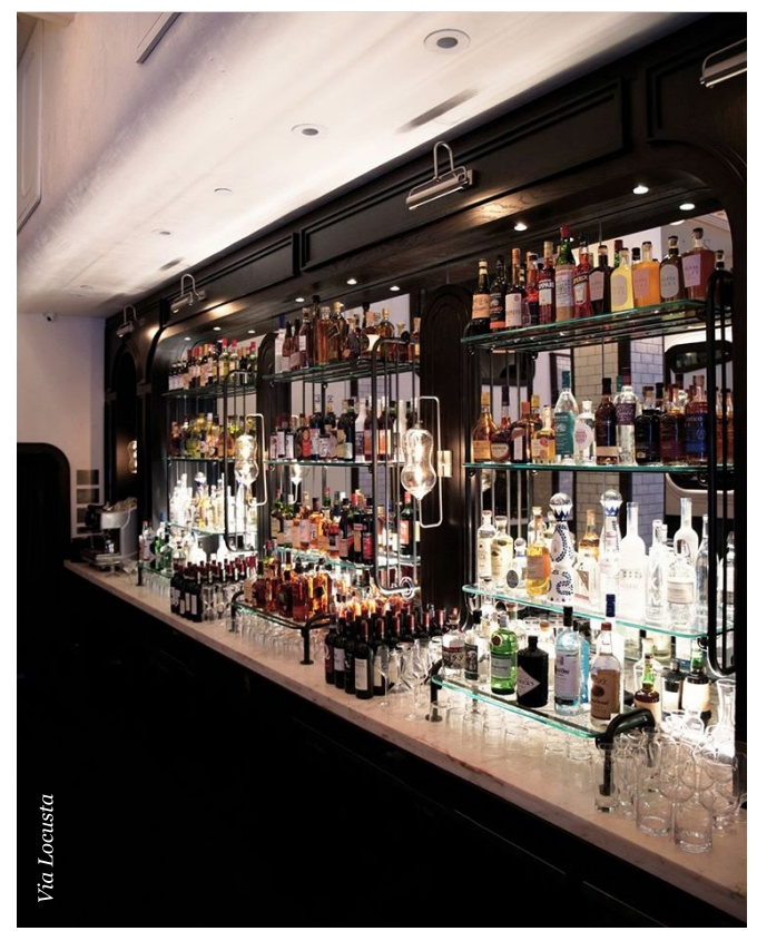
Via Locusta's handsome, well-stocked bar.