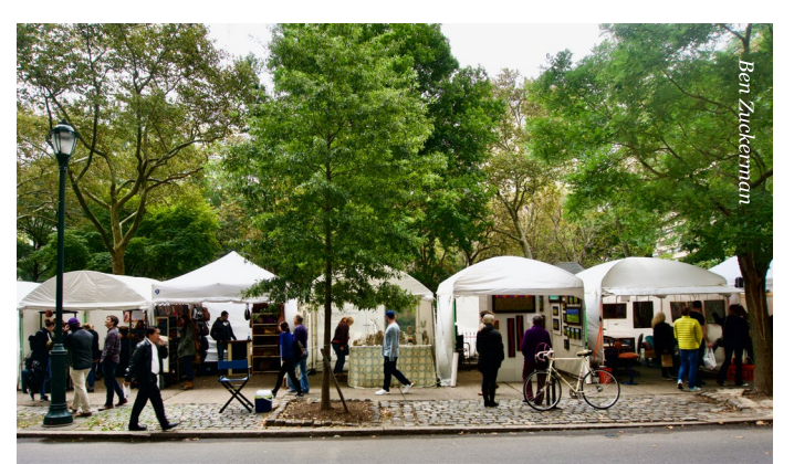
Rittenhouse Square Art Show.

To get the latest news about events in Center City, sign up for (IN) Center City, the e-newsletter of the Center City District: <u>http://</u><u>www.centercityphila.org/incentercity/signup.php</u>