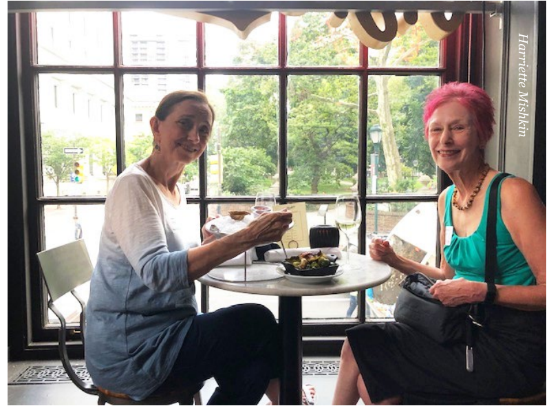
Penn's Village members make connections.

The <u>Penn's Village</u> mission is to "assist older neighbors to live independently... by providing caring services and programs that increase social engagement through a network of volunteers."