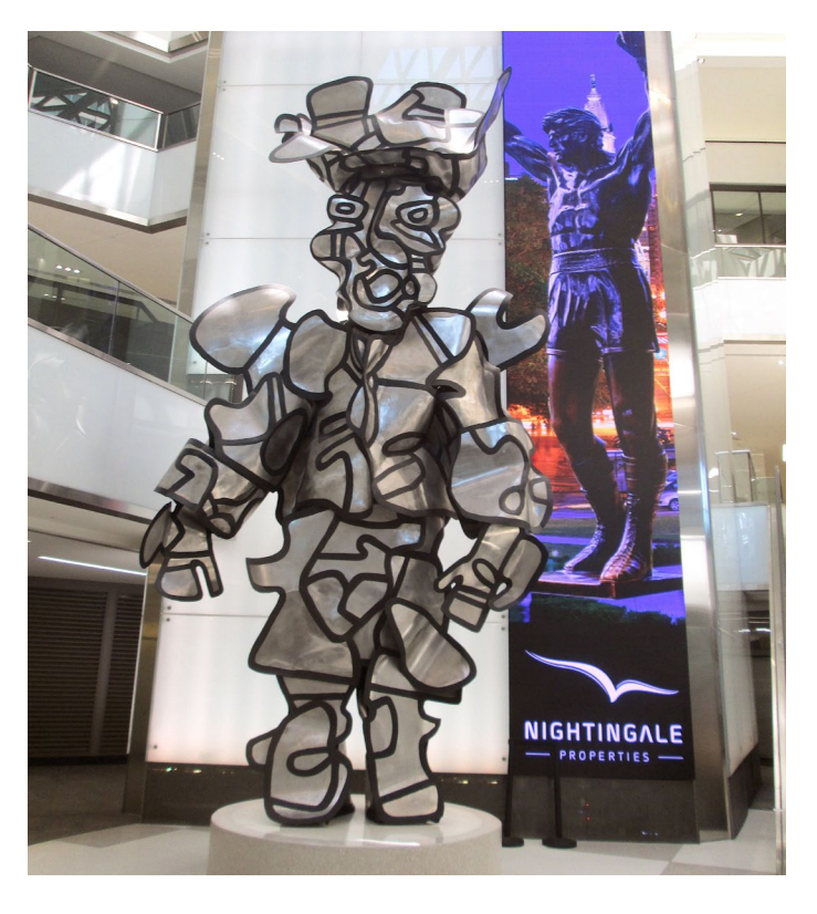
Continued on p.10