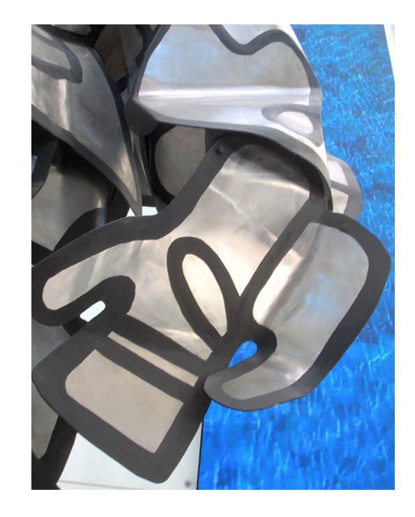
Here's a detail of the lower right leg. This plate, just above the foot, reminds me of a soccer shin guard. If you think it's armor, call it a greave. Note the rivets. (They're in the black.)

Left hand. I don't know why, but this is the only part of the statue that makes me feel comfortable. And no, I have no way to relate this hand to human anatomy.