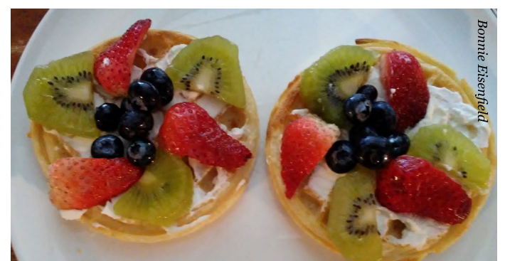
Quick, easy, tasty, and healthful Pi Day tartlets: round toasted waffles topped with sliced fruit and yogurt.

he was a longtime employee. It happened at a staff retreat following the death of Exploratorium founder and Nobel Prize nominee Frank Oppenheimer. (The date is also Albert Einstein's birthday.) In 2009, Pi Day, March 14, was officially recognized as a U.S. holiday, and is celebrated around the world.