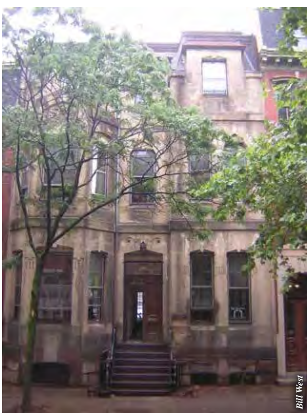
Rudolf Ellis house, 2113 Spruce Street, 1873.

I spend a fair amount of time in Asbury Park, a city that has also seen its share of devastation. A few years ago some intrepid techies put together an app that provided 3D images of structures along the boardwalk that aren't there any more, or that have changed greatly. As you walked along the boardwalk with a tour guide, you pointed your cell phone or tablet at a site, and up popped a ghost building. For good measure you could see the SS Morro Castle where it ran aground next to Convention Hall in 1934.