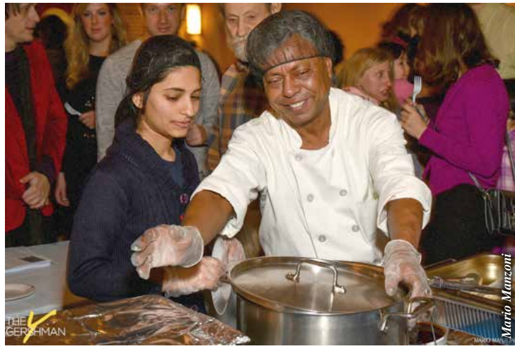
Patrons eagerly await a chef's next batch of latkes.

The framework of the event has seen a handful of modifications and mutations, but the core is always the latke and Philadelphia chefs, typically about a dozen, who each serve more than 300 latkes to sold-out crowds of up to 400 latke fans, some of whom come from states and counties far outside Center City.