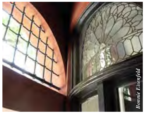
Architectural details feature a leaded glass fan light.

Conducting research at The Philadelphia Historical Commission at 1515 Arch Street is a simple process once you arrive. (Getting to the building requires navigation through construction blockades and various crosswalks with brief pedestrian signals.) Inside the building, a guard requires you to sign in, get a tag, and enter through controlled gates. The office is located on the 13th floor, behind a locked door. A friendly receptionist greets researchers,