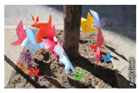
Some of the Pinwheels for Peace planted around the school by Greene Towne Kindergartners.

The Peace Table is just one aspect in which respect and peaceful resolution are nurtured in the Montessori classroom community. The uninitiated observer is amazed at the peaceful hum of the environment. Children are engaged and focused on activities of their own choosing. In the rare occasion that conflict