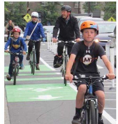
Berkeley, CA

The Philadelphia School 2500 South Street