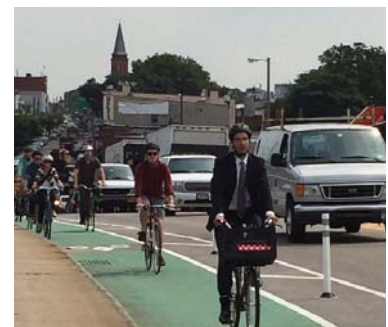
New York, NY