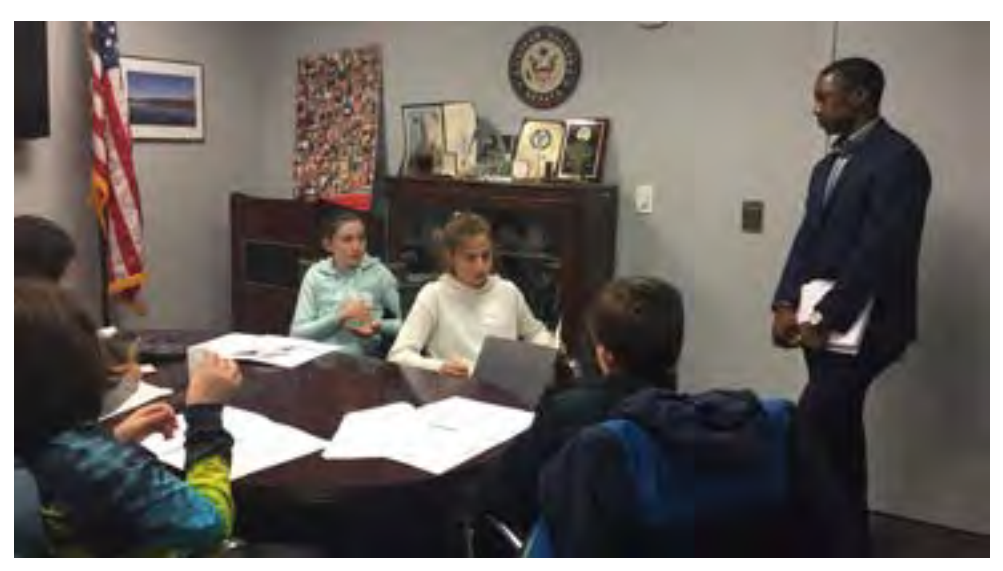
TPS middle schoolers meet with staffers at Sen. Casey's Philadelphia office.

The students – sixth-, seventh-, and eighth-graders – worked collaboratively