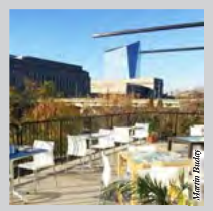
24's patio overlooks the Schuylkill River Banks with sweeping views of the University City skyline.

The restaurant is open 8am - 9pm, Sunday through Thursday; 8am - 10pm, Friday & Saturday. Eat in or take out. Website: www.24Philly.com; Phone: 215-333-3331; Instagram/Twitter: @24phl