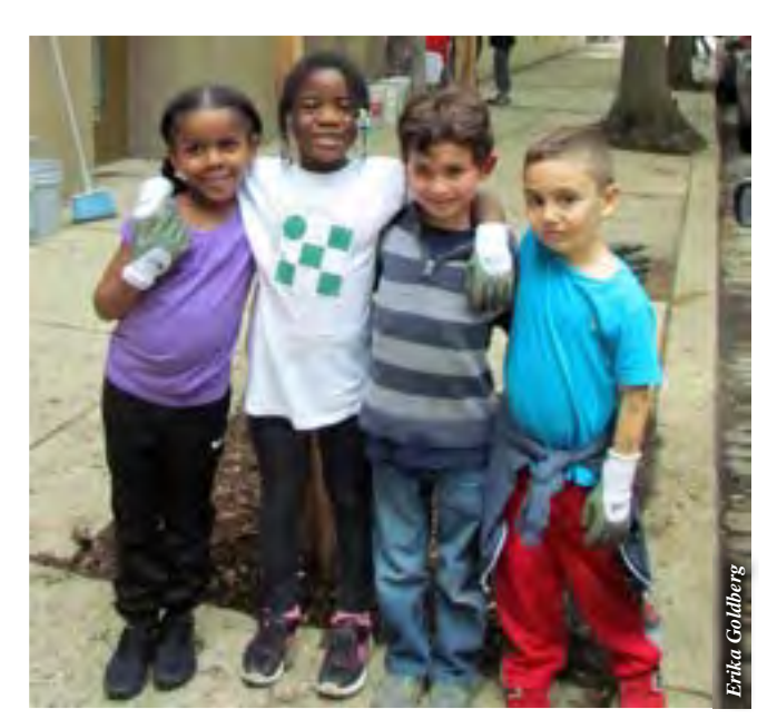
Greene Towners are proud of their tree-tending skills.

were no trees we wouldn't have any air." "Trees give us food: nuts, maple syrup, apples, oranges, cherries, bananas, pears, avocadoes, mangoes and coconuts." "Trees are pretty and give us flowers." "Trees give us shade." "Trees give us wood and we make houses and beautiful wooden toys and our play structure is made of wood." "Our classroom furniture and work is made from wood." "They give us paper so we can draw and write stories and make crafts." Trees also make homes for squirrels and chipmunks and birds, "where they build nests way up high," and "Cats like to climb trees."