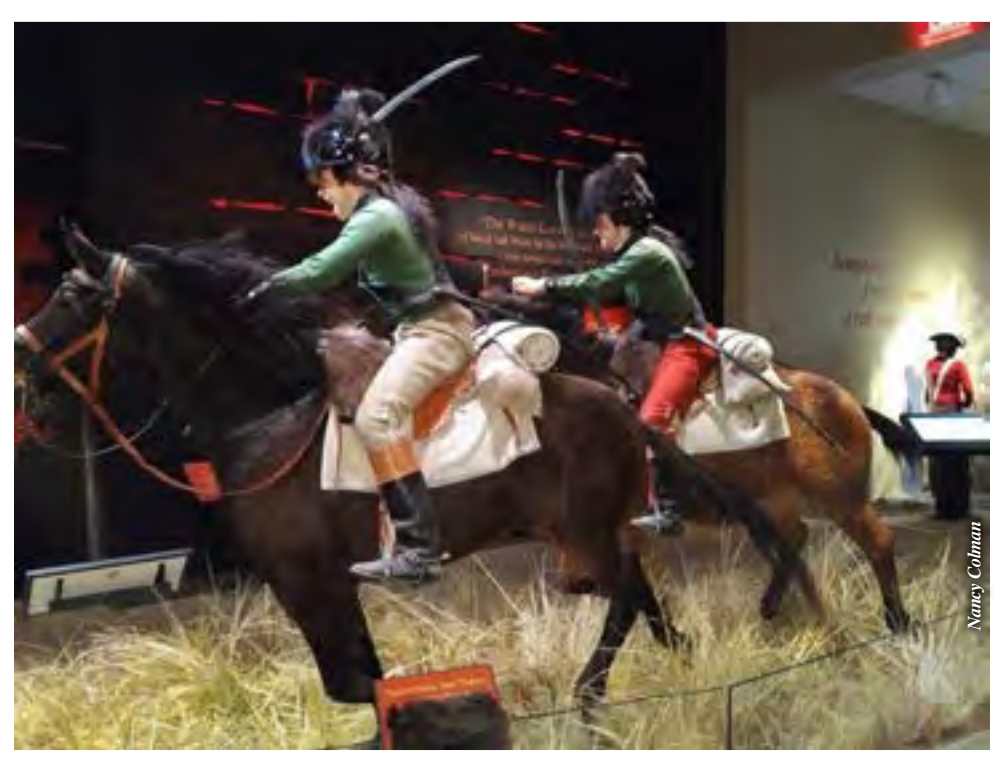
This dramatic diorama depicts captured Colonial soldiers forced to fight against their former comrades by their British captors.

In my history textbooks, white men seemed to be the only participants. At the museum I learned that women, people of color, and Native Americans participated in the Revolution. In our classrooms, the Revolution was over by a certain date in the school semester. The museum's introductory film tells us that the American Revolution lasted eight years and is still moving forward, its principles being embraced by segments of the American population and nations around the world.