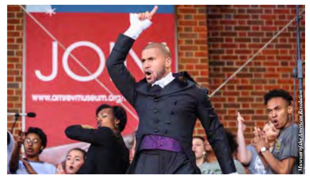
Broadway star Sydney James Harcourt, of the original cast of Hamilton, backed up by students from the Philadelphia High School for the Creative and Performing Arts, treats the crowd to a spirited selection of tunes from the hit show at the opening ceremonies.

realize that we were not all in agreement about everything that happened. Will students even be required to read history in the future? Will they get all of its contradictions or will it be packaged into neat linear events? I hope they will get a nice museum dedicated to the survival of democracy, as beautiful as the Museum of the American Revolution.