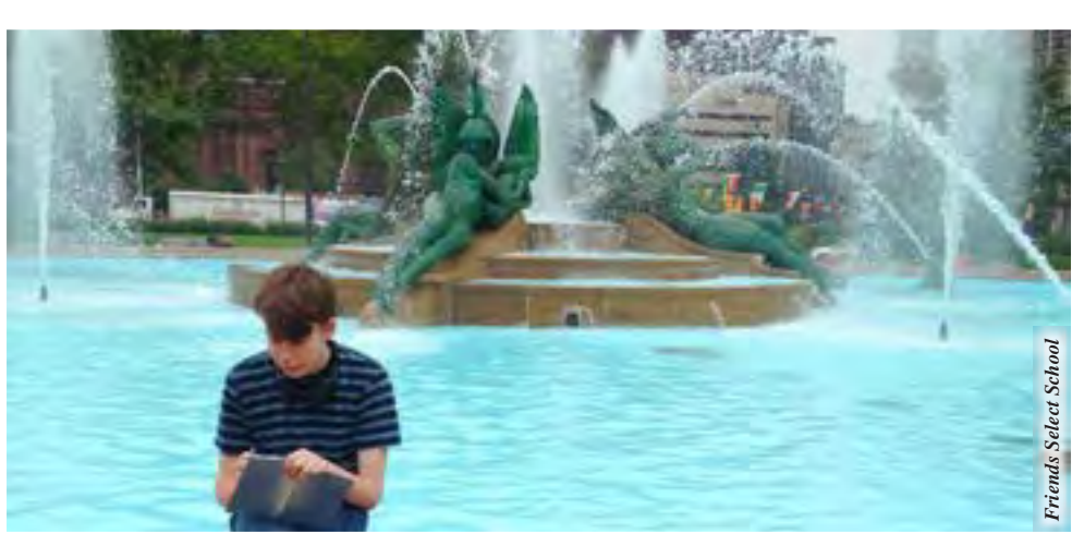
Friends Select School's SummerSessions provide a summer learning experience inspired by its Center City location.

"We are excited to grow our upcoming summer program to include students and