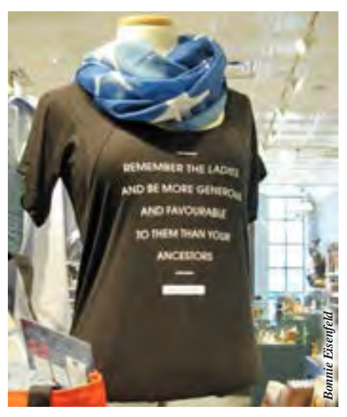
Items in the gift shop with quotations from Abigail Adams.