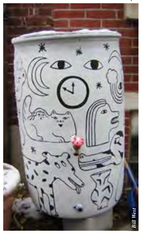
They only come in blue, but you're free to decorate. 2000 block of Moravian.