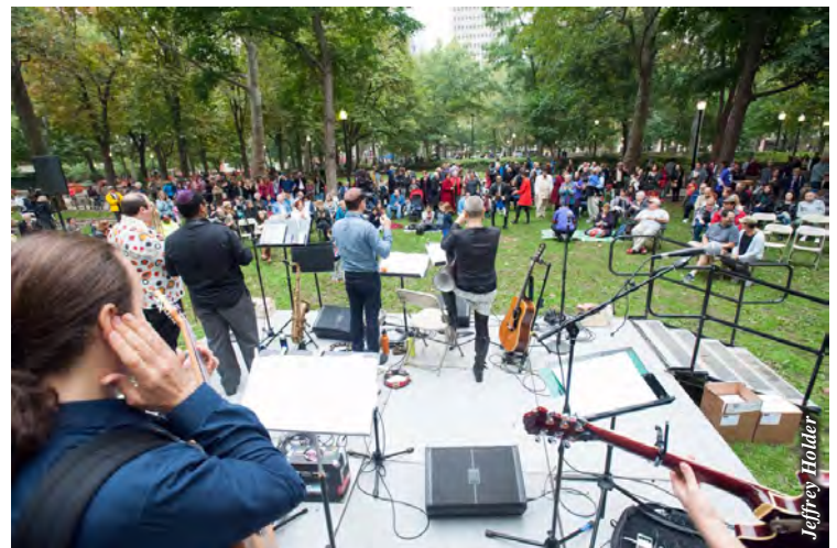
View from the stage at last year's RH 2 .