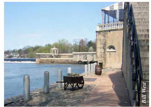
The esplanade by the Fairmount Water Works.

Beyond recreation and education, are there any other appropriate uses for the waters of the Schuylkill? Well, for some years I've been paying attention to the bicycling world in Philadelphia. Not so long ago, this was a world that was almost entirely recreational. But recently there has been a surge in the number of people biking to and from work, to drop the kids off at school, to go grocery shopping—you name it. Okay, I will: utility bicycling.