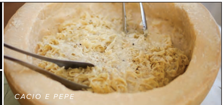
CACIO E PEPE