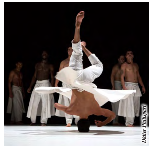
A spinning dancer with Compagnie Hervé Koubi.

One of America's most celebrated dancemakers, Paul Taylor defines modern dance in America in the 20th and 21st centuries. His repertoire of 142 dances explores a breathtaking range of topics. Taylor's stellar company will perform (November 2-5) three of his masterpieces showcasing his brilliance, uncanny wit and unparalleled vision. Esplanade (1975), Taylor's signature work to Bach, is based on the joyfulness of everyday movement—running, falling, catching and sliding. Company B (1991), to the Andrew Sisters' hit songs, evoke the spirit of the 1940s—a nation at war, yet living fully. Vignettes are inspired by the social dances of the day (the Lindy, polka and jitterbug) as soldiers lurk in the shadows. Arden Court (1981), a playful yet majestic work about love and relationships, to Baroque composer William Boyce's music, is considered by critic Clive Barnes to be "one of the most sentimental works of our time ... something extraordinary in the history of dance."