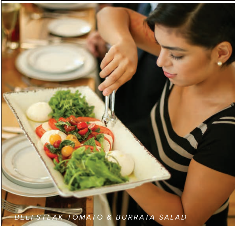
BEEFSTEAK TOMATO & BURRATA SALAD