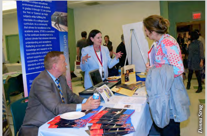
Participants in last year's School Fair gathered valuable information about area schools.

The 6th Annual School Fair, co-sponsored by CCRA, will be held again this year at The Franklin Institute. Representatives from area public, independent, and parochial schools will be on hand to answer your questions. Tuesday, October 17, 5 - 7pm.