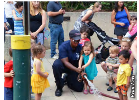
A Philadelphia firefighter helps little ones operate a fire hose.

Even if there had been attempts by a jingling ice cream truck to lure them away on a hot night, it would not have deterred the long line of adults and children at Markward Playground on Wednesday evening, July 12. They were waiting for the much-anticipated event—The Friends of Firefighters, sponsored by CCRA’s Education and Family Committee.