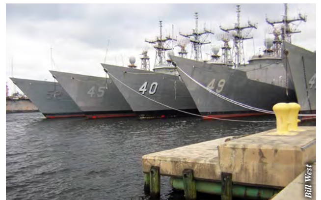
Philadelphia Navy Yard at South Broad Street.