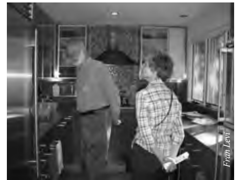
Visitors note the chef's kitchen in a house on the tour.