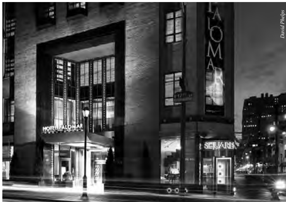
Housed in the former Architects' Building, the Palomar has retained and refurbished many features of the Art Deco gem at 17th and Sansom.

As was its intent, the building housed Cret's offices and those of many other architects and engineers, as well as the Philadelphia chapter of the American Institute of Architects