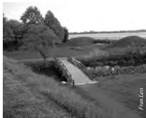
A Revolutionary-era Brigadoon, secluded and well-preserved, Fort Mifflin is only a short ride from Center City

For more information, visit www.fortmifflin.com or call 215-685-4167.