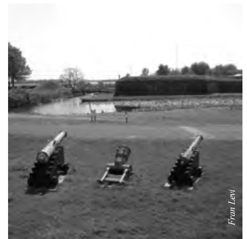
Within the walls of the fort are cannons and carriages, officers' quarters, soldiers' barracks, a blacksmith shop, a bomb shelter and a museum.

The defense of the fort allowed George Washington to reposition his army at Whitemarsh and to withdraw to Valley Forge. Today as the planes roar overhead, the pockmarks on the white stone walls stand as a link to the time when Fort Mifflin flew the flag under fire at the epicenter of the American Revolution.