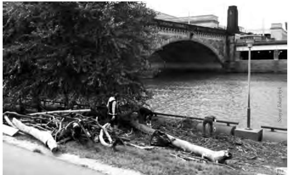
Friends of Schuylkill Banks (FOSB) organized their first volunteer clean-up day in response to floods in October. Along with volunteers from the Schuylkill River Development Corporation, members of FOSB cleared tons of wood that had washed up from the river onto the Schuylkill Banks.