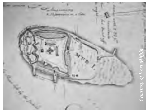
Although the fort has been restored, its outlines remain unchanged, as seen in the above drawing dated 1777.

Michelangelo's contribution to the design of fortification in the 16 th century came at the call of his native Florence. The city, fearing an attack by the troops of the Holy Roman Empire, had no time to rebuild its insubstantial medieval walls. Michelangelo devised a way of fortifying the gates so that they reached outward and afforded the protection of covering fire to defenders of the city, anticipating by a century the French template for Fort Mifflin and its contemporaries. Vauban adopted Michelangelo's innovations and bequeathed them to the Marquis de Fleury, Philippe Tronson Du Coudray, Louis Du Portail, and Anne-Louis de Tousard, engineers