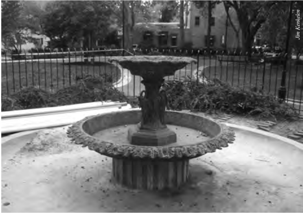
The new "green" fountain was installed through the efforts of the Fidler Square Improvement Association.