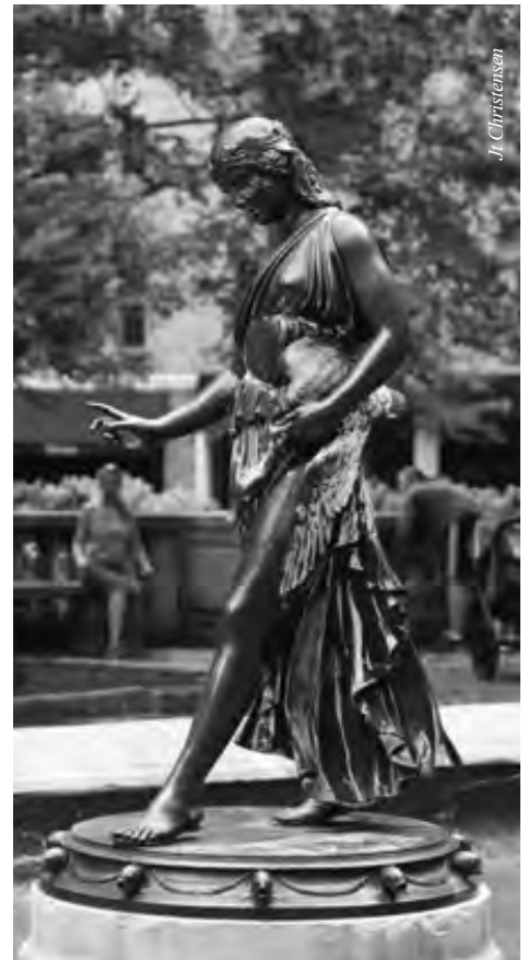
Paul Manship's "Duck Girl" presides over the reflecting pool.

along the Parkway and Kelly Drive, are no fewer than 35 important works: the Swann Fountain, the newly regilded Joan of Arc and "The Thinker," for example. To prepare for a longer tour, or to take a virtual one, try Fairmount Park's website, museumwithoutwallsaudio.org . You'll be presented with an audio slideshow and an audio guide for your own exploration of these unique treasures.