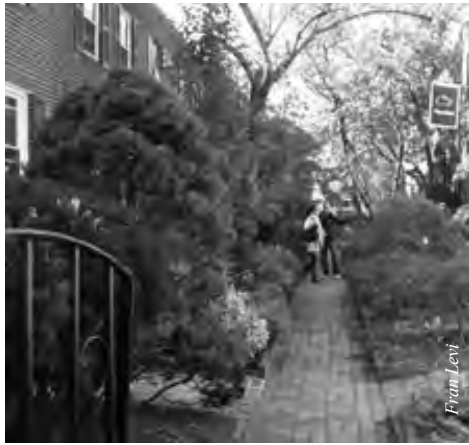
A house on Croskey Mews with its well-tended garden was featured on the house tour this year.