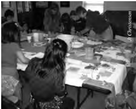
Children ages six to 12 participate in the BoConcept Arts Program at Markward Recreation Center.

The Markward Playground and Recreation Center, located at 400 S. Taney Street, is a heavily utilized facility employed for a variety of uses. Kids play on the playground and playing field, a widely popular summer camp provides amusement and education to over 150 campers each year, an afterschool session takes place each school day, and a variety of other programs are held from time to time for both adults and children. Adding to the already excellent programming, in fall 2010 the Markward Recreation Center in collaboration with the Friends of Schuylkill River Park initiated an arts program for children ages six to 12. The idea, developed about a year earlier, consisted of bringing in professional artists in a particular medium – artists who also had experience working with kids – to teach a program in our neighborhood that was financially accessible to pretty much anyone. Meeting all these requirements required a great deal of coordination, from working out times