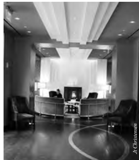
The interior of the Palomar displays the elegance of Art Deco style.

A footnote on the lead architect. Born in France in 1907 and a product of the Ecole des Beaux-Arts in Lyon, in 1907 Paul Philippe Cret was appointed a professor of design at the University of Pennsylvania, where he taught for 34 years. The output of his private practice