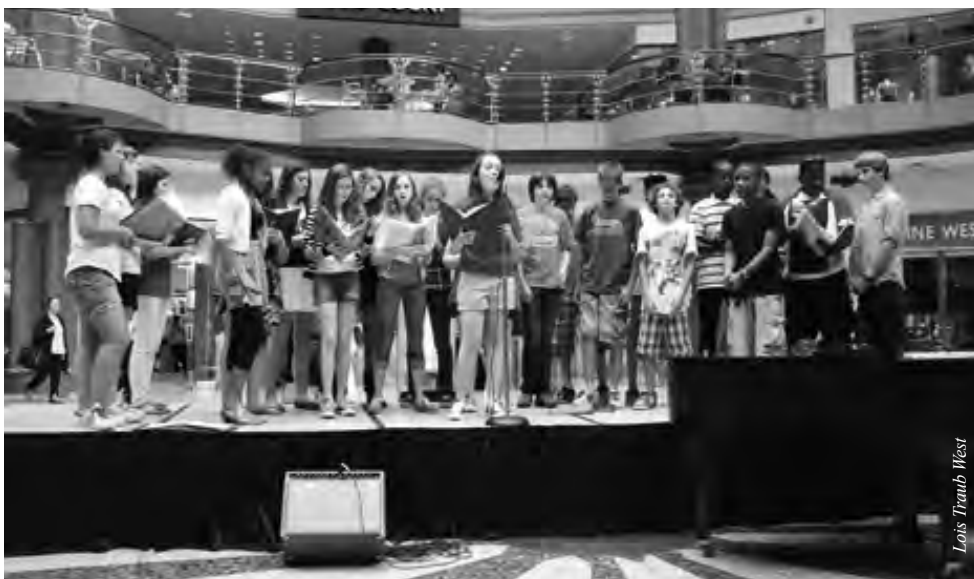
Students from The Philadelphia School perform at Liberty Place (above) and at other venues around the city.

The Philadelphia School, located at 2501 Lombard Street, educates children in preschool through 8th grade.