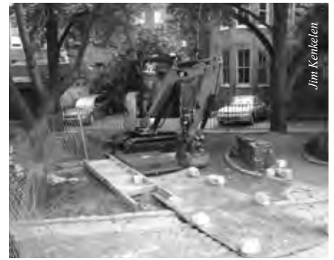
Portions of Fidler Square were dug up during the installation of the fountain's new recirculating pump system.