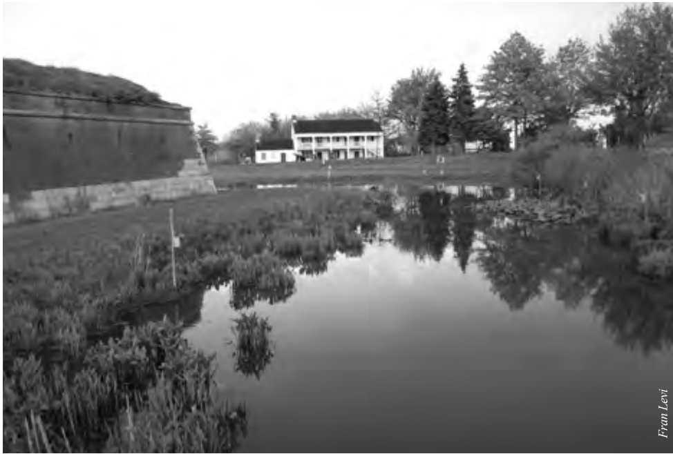
In 1777 a small garrison at Fort Mifflin held off the British fleet during a five-week siege, allowing Washington's army to withdraw to Valley Forge.

These days the planes fly in low over Fort Mifflin. Standing in the flight path to Philadelphia International Airport, hearing the engines roaring above, a visitor to the fort can almost imagine being in a war zone. In 1777, Fort Mifflin was at war. Under siege from the sea rather than the air, the fort stood its ground for five weeks as the battered focus of the American Revolution.