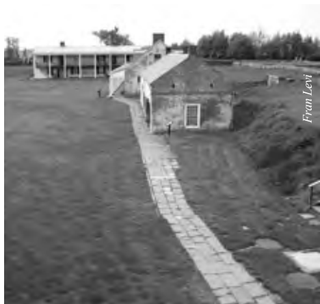
Set in a 49-acre national historic park, Fort Mifflin was part of the U.S. coastal defense system through the 1950s.

The design of Fort Mifflin is descended from Michelangelo via Louis XIV, in the person of Sébastien le Prestre de Vauban, marshal of France under the Sun King. The various French engineers who worked on the fort had in common a passionate devotion to the genius of Vauban, who believed that by employing perfect proportions, every angle of a wall would be covered, thus ensuring the defensive superiority of siege warfare. His designs were discussed in the same breath as those of the foremost landscape architects of his day. Vauban and Le Nôtre, who was responsible for the gardens of Versailles and of virtually every other notable chateau of 17 th century France, were friends and colleagues, practitioners of the sister arts of earth-moving.