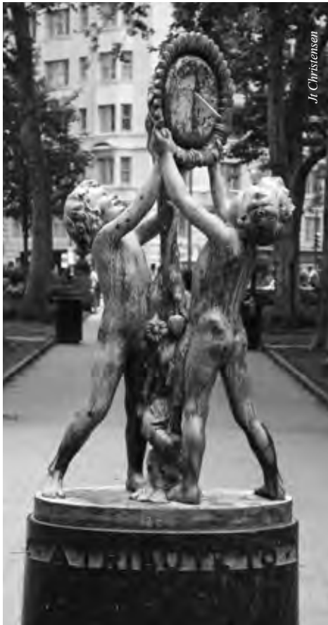
The sculpted children holding a sundial aloft have watched over generations of children at play in the square.

The centerpiece of our neighborhood, the square is a green oasis in a sea of concrete. It's been described as "Philadelphia's Living Room." We all know that it was originally Penn's Southwest Square, and that its present layout was the work, in 1913, of Paul Cret, whose fingerprint is everywhere in the city. But did you know it's also