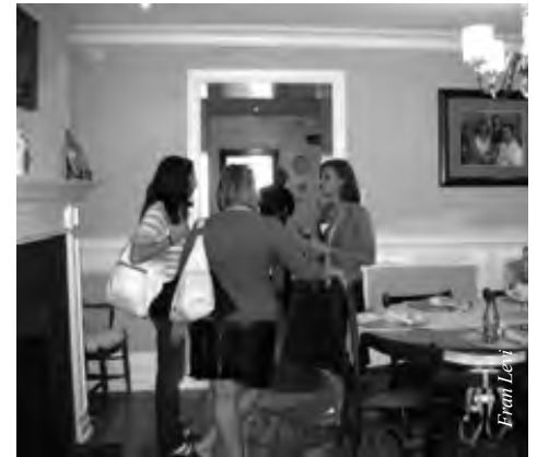
The owner of a house on the tour speaks with visitors.

Thank you also to the board, the committee, the support staff, the writers, the public relations consultant, those of you who took ads in the ad book and all that we may have missed.