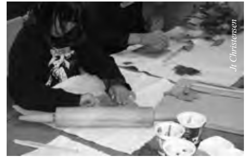
A rolling pin is used to create works of art at the Saturday arts program.

On top of these details, the largest challenge entailed locating a source of funds to underwrite the program, which would enable Markward and the Friends of Schuylkill River Park to maintain the highest caliber education and cover the large start-up costs for supplies, equipment, and storage, while still generating classes affordable to all those in the Recreation Center's reach. BoConcept, the modern design furniture store located in the 1700 block of Chestnut Street, generously offered to provide a grant that covered all these costs and made possible the arts program, which otherwise would not have happened. We have thus named the program the BoConcept Arts Program. In fall 2010 the program consisted of two classes, one in clay hand building and the other in painting. The clay classes were taught by artists and teachers from the Clay Studio (139 N. 2 nd Street) and the painting classes by artists and teachers from the Fairmount Arts Center (2501 Olive Street). Both classes were capped at 12 students and ran for seven week sessions on Saturdays. Fees were on a sliding scale; all participants were asked to pay $35 for all seven weeks, although no one was denied admission because of inability to pay, and those parents who were able were asked to pay an