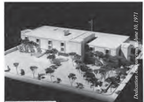
An architect's model shows the design of the Albert M. Greenfield Elementary School, circa 1968.