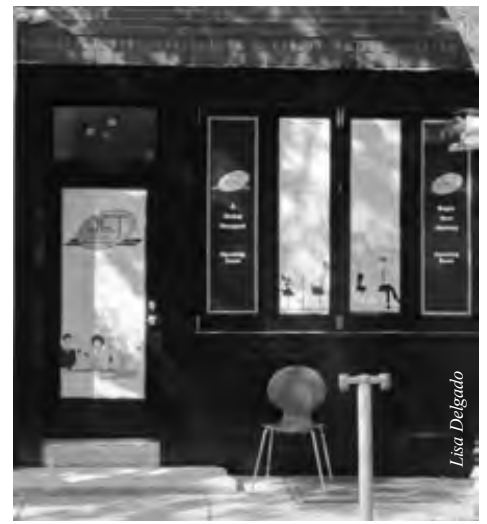
The Jet Wine Bar at 1525 South Street offers wine from around the world.

That is what the South Street West Business Association (SSWBA), a group of business owners who have been working to revitalize the commercial corridor since the late 1990s, hopes to change.