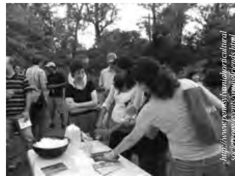
PHS Young Friends attend educational programs, participate in plantings and related activities, and make new friends at networking events.

In addition to the opportunity to mix and mingle with similarly interested individuals and support local institutions, young friends memberships often come with added perks like reserved seating at events, special invitations to private gatherings, and discounts at participating local retailers. Besides the Free Library of Philadelphia, one can friend the Pennsylvania Academy of Fine Arts, the Pennsylvania Ballet,