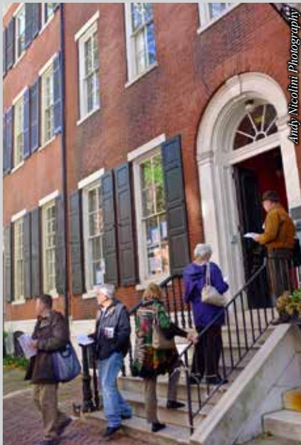
House Tour visitors gather outside the Preservation House on Delancey Place, for a glimpse of an ongoing restoration project inside.