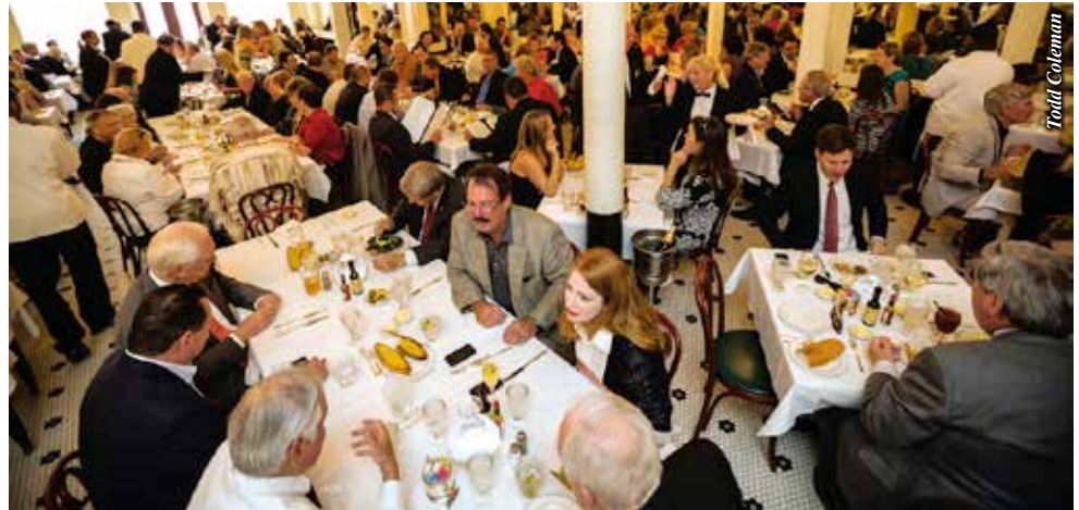
A packed house, an absence of soft surfaces, and noisy neighbors at the next table can make for a deafening dining experience.

Craig LaBan, restaurant critic for the Philadelphia Inquirer , often criticizes the loudness of restaurants and even mentions the specific decibel level. Websites like Open Table include restaurant patron reviews rating noise levels, and comments on Yelp indicate that many diners are looking for quieter restaurants. Perhaps avoiding indoor