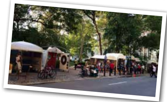
Fine Arts Fair and College Fest: Annual fall traditions fill the Square.