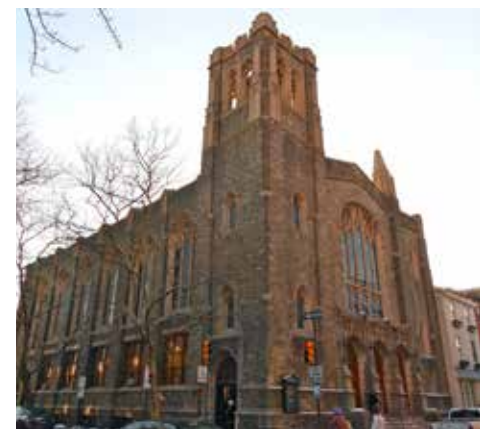
Wesley A.M.E. Zion Church, 1500 Lombard Street, in the Rittenhouse Square East neighborhood, was listed on the NRHP December 1, 1978.

Updated information and further details are available at www.centercityresidents.org . This event is being sponsored by Atkin Olshin Schade Architects.