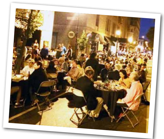
A Fine Arts Fair favorite: on Saturday, September 20, during the show, Rouge, Devon and Parc offered the 18th Street Outdoor Café, sponsored by the Friends of Rittenhouse Square.