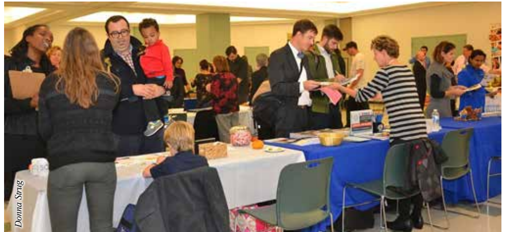
Dozens of families browsed information tables and chatted with school reps at the Third Annual Elementary School Fair.

This is the second year that the Franklin Institute partnered with CCRA, LSNA and SOSNA to put on the School Fair. The Franklin Institute generously donated the