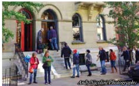
Patrons line up to get a look inside one of the 11 homes on the tour.