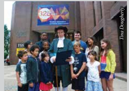
Students from all divisions stand with “William Penn” as he reads the proclamation.

Both Friends Select and William Penn Charter Schools trace their roots to the founding of the first Quaker school in 1689, and each is celebrating this milestone year. For more about Friends Select's history visit http://www.friends-select.org/about/mission-history/index.aspx .