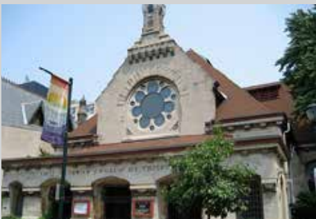
First Unitarian Church, at 21st and Chestnut, was designed by Frank Furness.

As part of an ever-expanding interfaith community in Center City West, local places of worship are joining together to create a Sacred Spaces Open House tour. Thirteen participating congregations open their doors to visitors Sunday, December 14, from 1 to 4 p.m. Congregants and