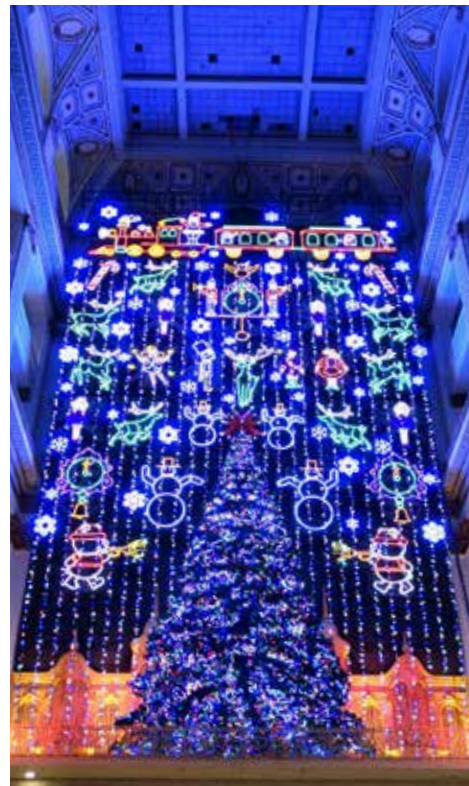
Macy's Christmas Light Show.

2008 Delancey Place Reading Groups, Hands-On Tours, Exhibitions and Programs For more information, please go to rosenbach.org