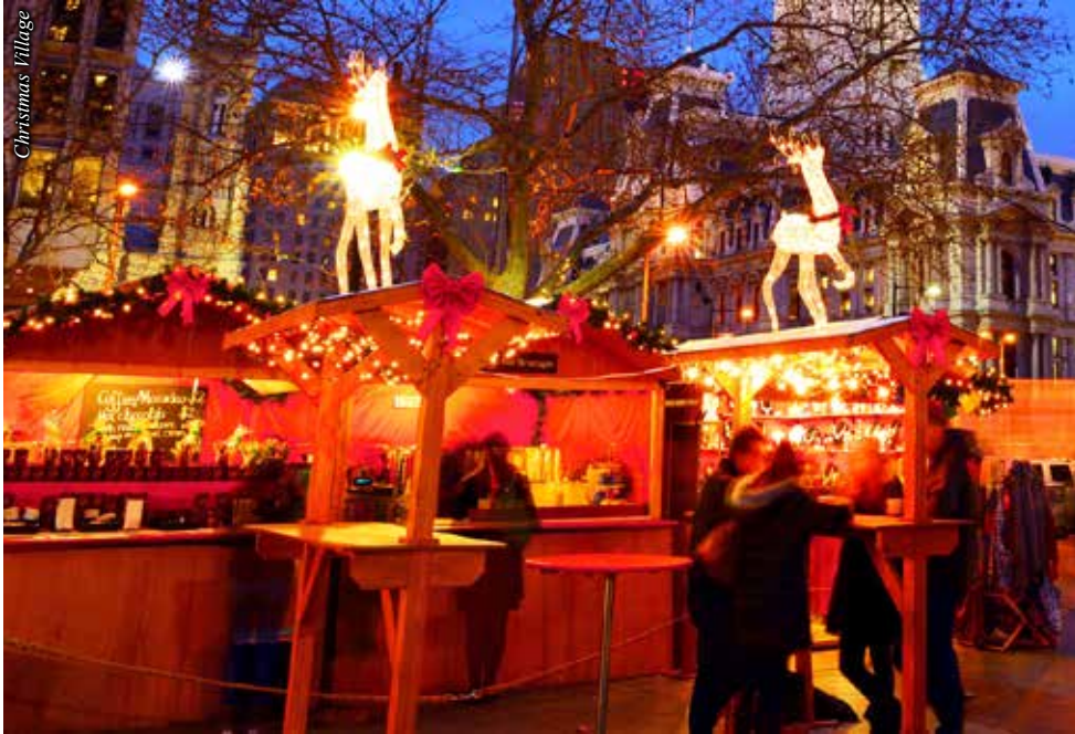
Prancing reindeer alight on traditional food stalls of the Christmas Village Market.

What better way to embrace this festive season than taking in the sights and sounds of a genuine Christmas market right here in Philadelphia? For the seventh straight year Christmas Village in Philadelphia will bring the unrivaled holiday atmosphere of a traditional German Christmas market ( Weihnachtsmarkt ) to Center City. From Thanksgiving Day to December 28 Christmas Village is situated once again in Center City's own LOVE Park (JFK Boulevard between 15th and 16th Streets), making it convenient and accessible for all Center City residents.