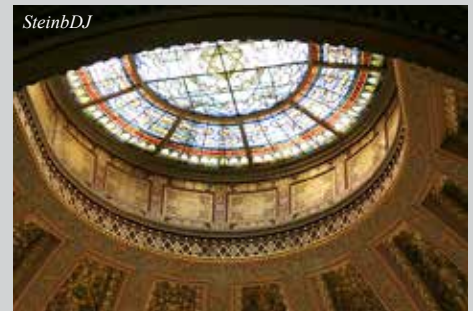
A magnificent skylight crowns the altar of the Church of the Holy Trinity on Rittenhouse Square.