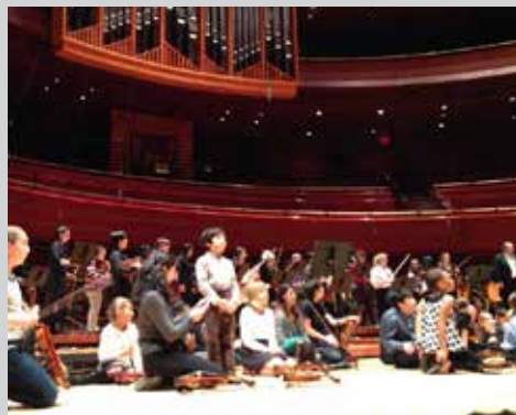
Young musicians join in a recent PlayIN.

Viola PlayIN: Saturday, February 21, 2015 Brass PlayIN: week of April 21, 2015