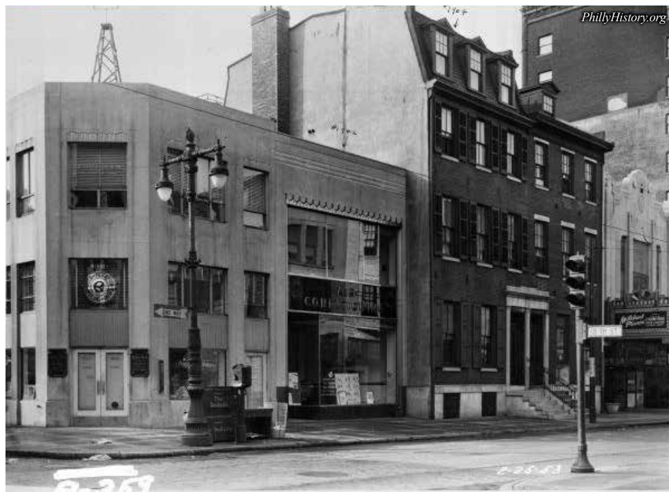
Southwest corner of 19th & Chestnut, 1945; note the Boyd Theatre, far right.