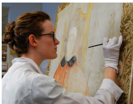
Inpainting a mixed-media wallpaper panel from Historic New Orleans Collection.

CCAHA specializes in the care and treatment of art and historic artifacts on paper. Highly trained conservators on staff do painstaking, technical work to restore and preserve paper items, not only for private family heirlooms, but also for many large institutional collections of art and historical artifacts.