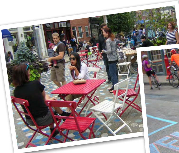
Grays Ferry Triangle. Business as usual at 23rd and South – busy.