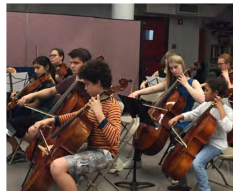
Combined master class.

Families provided home stays for the Icelandic musicians, who spent their spare