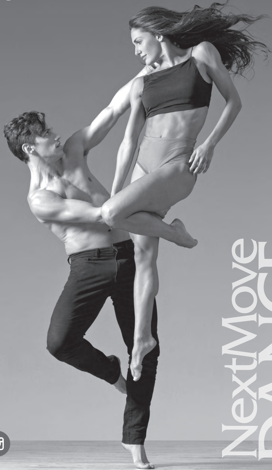
Parsons Dance: Photo Courtesy Lois Greenfield