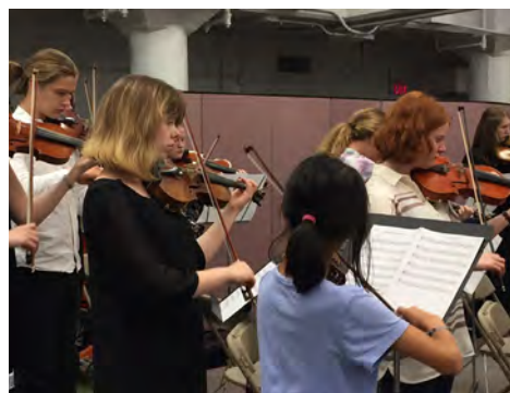
Young musicians from TPS and Iceland's visiting youth string orchestra rehearse together.

In October, The Philadelphia School and Temple Music Prep co-hosted a weeklong visit to Philadelphia of the Icelandic Tonskoli Sigursveins Youth String Orchestra. The orchestra's itinerary included a daylong rehearsal at The Philadelphia School's performance venue – The Garage – with performances at Temple Prep, at Philadelphia's Creative and Performing Arts High School, and at TPS.