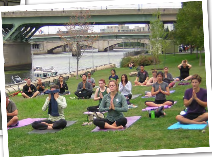
Saturday morning yoga went off without a hitch.