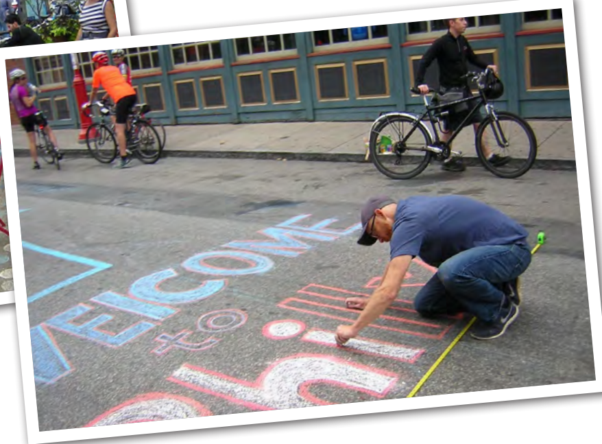
South at Front Street. Many, many bicyclists joined the promenade, working well with the throngs of walkers and runners. Streets were often extremely crowded, but everyone seemed to get along. Matching your speed to your surroundings appears to be the key.