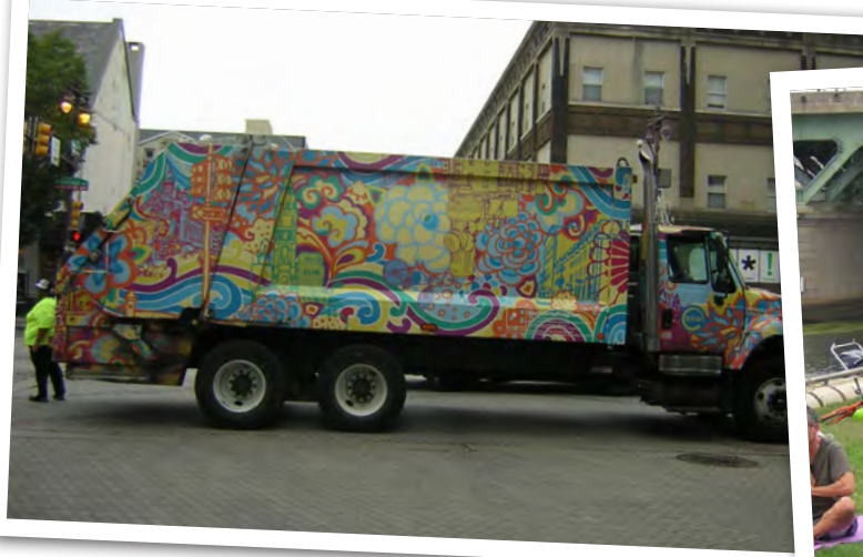
Learning from Nice. A mural arts garbage truck blocks South Street at Broad. A terrorist would have found it difficult to replicate the Nice truck attack here. Barriers everywhere – permeable to pedestrians and bicyclists; to drivers of large trucks, not so much.

Editor's Note: Inspired in part by the Pope's visit, with its unintentional experiment of Center City streets populated only by walkers and cyclists—minus the intrusion of motorized vehicles—a day was deliberately set aside in late September to recreate that heady sense of people power. The length of South Street was closed from river to river to all vehicular traffic. Our intrepid writer Bill West set out to document the day; here are some of the scenes he captured.