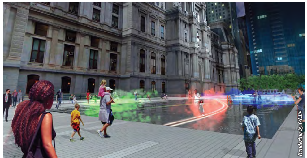
Embedded in Dilworth Park's fountain, Pulse, designed by internationally recognized artist Janet Echelman, traces above ground in real time the movement of the three subway lines below, using four-foot-tall thin curtains of dry mist in colors corresponding to each transit line. Orange, blue and green mists evoke the steam emanating from the city's first water-pumping station, located on this site, and the steam from the trains at the Pennsylvania Railroad Station that stood across the street. To see an animation of the fountain, visit http://www.echelman.com/project/pulse/