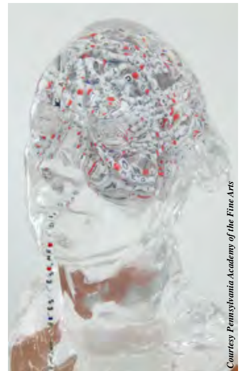
"Modern Washington" by Brian Tolle called No. 1 (First Inaugural Address), a cool new acquisition that will be in the show.