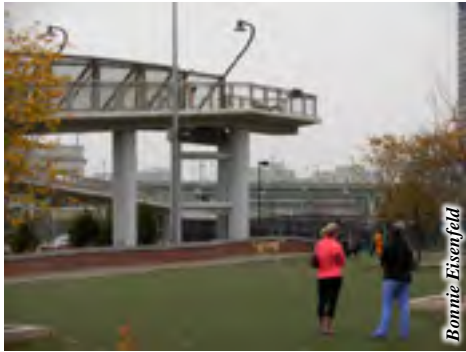
Pedestrian bridge leading to the Schuylkill Banks Boardwalk

Fitler Square , situated between 23rd and 24th Streets and Panama and Pine Streets, is a half-acre, 100+-year-old pocket park named for Philadelphia mayor Edwin H. Fitler. A Victorian fountain