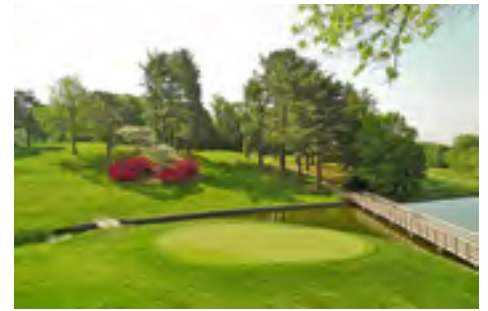
One of the beautiful vistas at Bala Golf Club.

With its majestic setting, delicious cuisine, and unmatched service, Bala Golf Club also functions as one of Philadelphia's premier event venues. Whether hosting an intimate affair for 30 or an elegant event for 200, clients will find that Bala Golf Club exceeds every expectation. Their spacious and newly renovated event facility is ideal