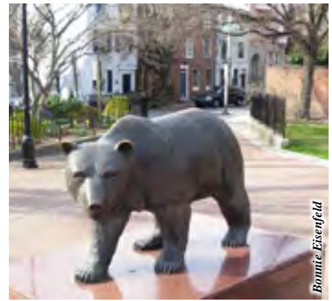
Grizzly by Eric Berg

Cret Park is a landscaped plaza on the Benjamin Franklin Parkway at 16th Street. Open seven days a week, 24 hours a day. http://www.ccdparks.org/cret-park