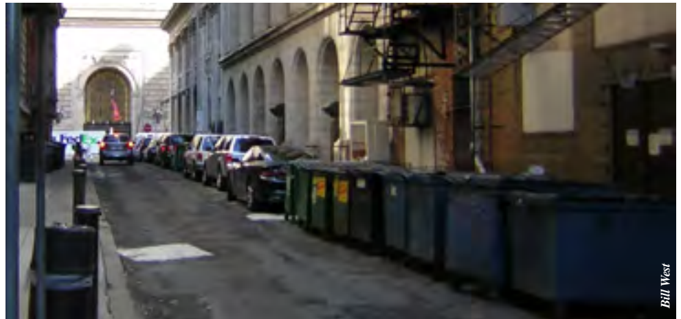
Welcome to the 1400 block of Moravian Street, largely devoted to the storage of trash.

The design of the Drexel and Company building is based on the Palazzo Strozzi in Florence. The Strozzi were rivals of the Medici, and they had a better architect. The Drexel building went up between 1925 and 1927.