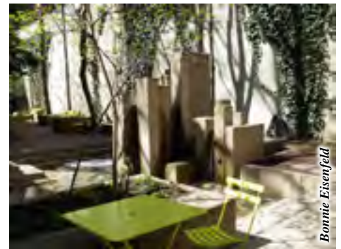
John F. Collins Park

Schuylkill Banks , adjacent to the Park, runs along the river's east bank and includes