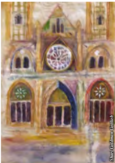
A painting by the author, that was recovered from the debris during a brief salvage operation.

And then I opened the apartment door. Thick white smoke was writhing in strips drifting in upon itself. As I closed the door behind me, the smoke stifled my breath, lungs working to suck in air that wasn't there. After fishing around for my keys, I noticed I was holding them in my hand, when the realization struck that I didn't have the breath to stay in the smoky hallway long enough to lock the door.