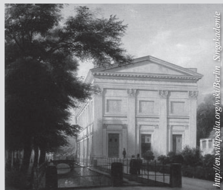
The Berlin Zing Akademie housed 17 th and 18 th century music that was hidden during World War II in a Polish castle. Eduard Gaertner's painting depicts the Akademie in 1843.