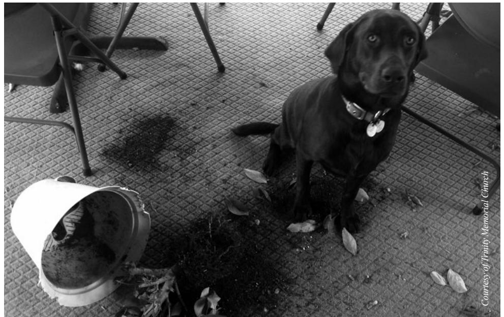
I didn't knock over the plant.