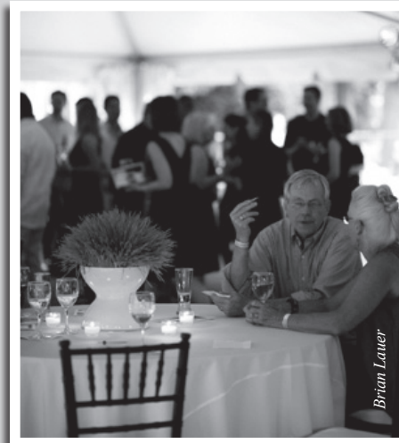
Eat Drink and Be Green attendees enjoyed live music, good food and conversation under a tent in Schuylkill River Park.