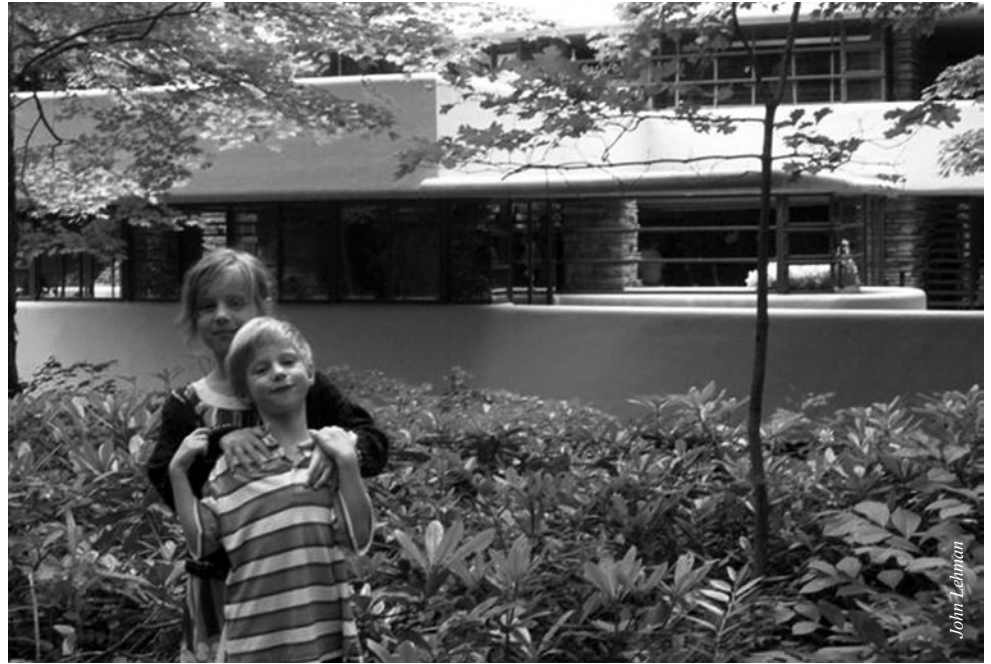
Frank Lloyd Wright's Fallingwater offers special tours for children five and older. The author's children explored hands-on architectural concepts using blocks and the famous house itself.

Traveling north, we experienced what came to be known as our Fossil Fuel Fun Day. First, in Tarentum, we descended the Tour-Ed Coal Mine. Our guide worked in the mines for 40 plus years and brought the history of coal mining to life with his stories. I had no idea what dark really was until he turned off the lights 160 feet below ground. Then we drove to Titusville, site of the first commercial oil well. After the cramped corners of the mine, the Drake Well Museum and Park allowed little legs to run free. Arriving in Erie, we settled in to watch the sunset over the water, something my kids had never seen before. We spent the next day on Presque Isle peninsula—who knew Pennsylvania had beaches?—where my daughter loved swimming in a cold Lake Erie. We also visited a fantastic Maritime