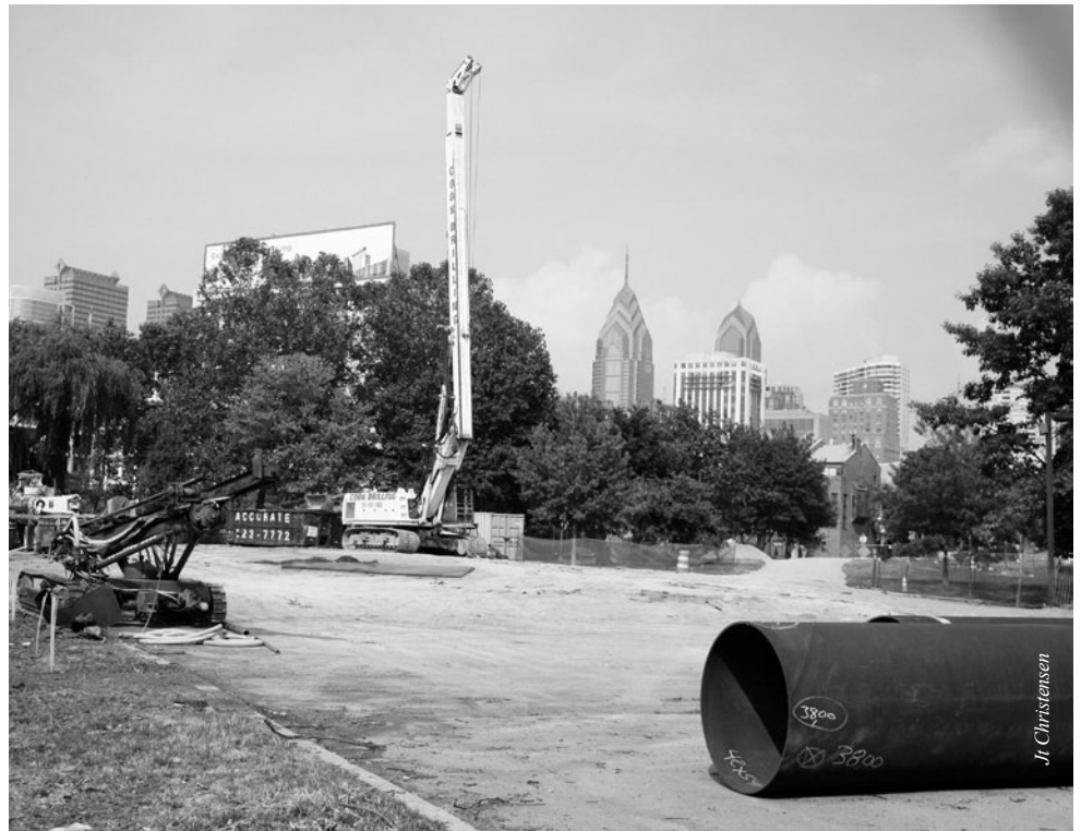
Portions of Schuylkill River Park are closed to the public as construction of the pedestrian bridge over the CSX tracks begins.

The audience was invited to ask questions. As a majority of the audience appeared to be people using the two dog parks, most questions concerned the temporary small and large dog parks. Focht committed to considering their requests for a larger