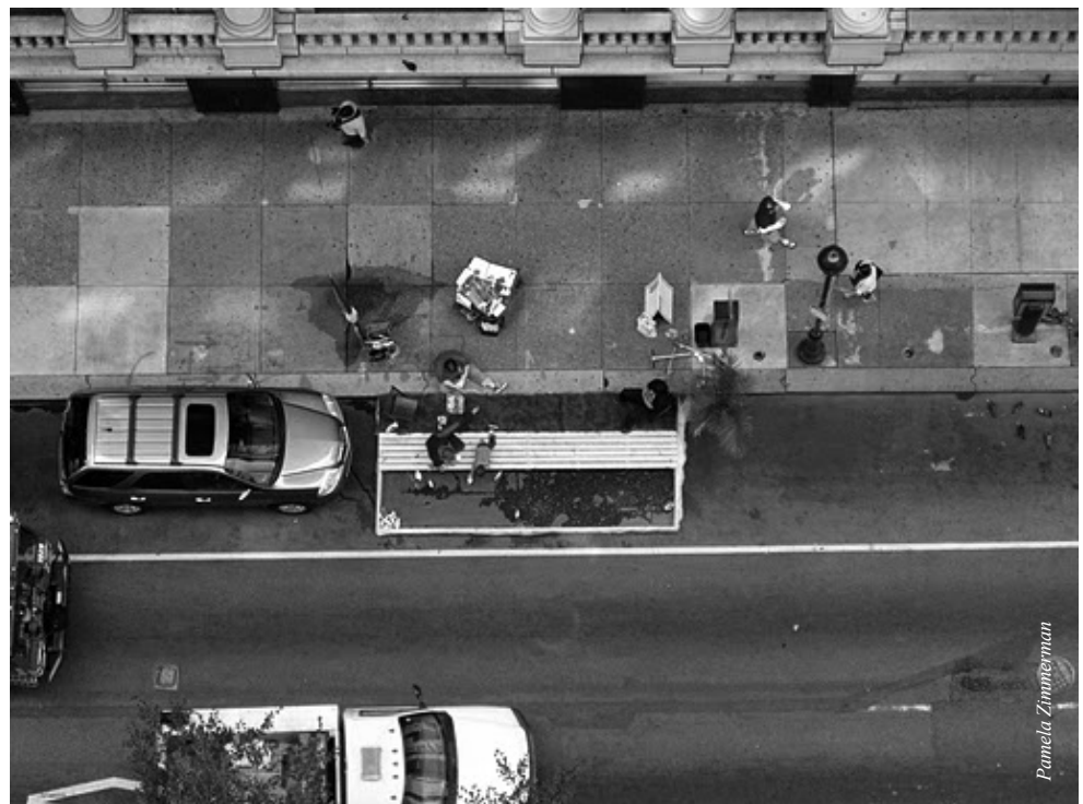
A temporary pond was constructed in a parking space on Walnut Street between Broad and 13th streets. The public was invited to make and float a paper boat in the temporary pond.