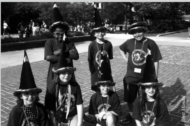
Independence Charter School students competed against 52 teams at the 2011 Odyssey of the Mind World Finals at the University of Maryland.

Competing against 52 teams, the ICS students finished seventh. Only six places were recognized, and the team missed a place on the podium. Nevertheless, the children were excited about the trip to the finals and had a great time.