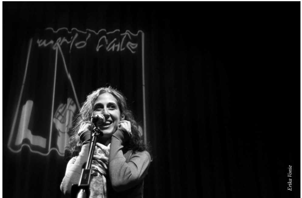
A contestant tries to win over the StorySlam audience by sharing her personal accounts of events and experiences.

StorySlam storytellers are not simply spinning yarns. The competition doesn’t set out to find the tallest, most sensational tale. These are real people telling true stories. The mechanics of a StorySlam are simple, but the format provides an element of surprise even for the storytellers. Each Slam has a theme, and storytellers can prepare their stories in advance. However, no one knows in advance who will get a chance to tell a story that night. Potential storytellers write their names on slips of paper and drop them in a bucket as they enter the venue the night of the event. Ten competitors’ names are drawn from the bucket, one at a time as the event progresses. Each storyteller has five minutes to tell a story and impress the audience. The highest-scoring storyteller for the evening wins the Golden Ticket, an invitation to the biannual GrandSlam. There, winners will compete for the title of “Best Storyteller in Philadelphia.”