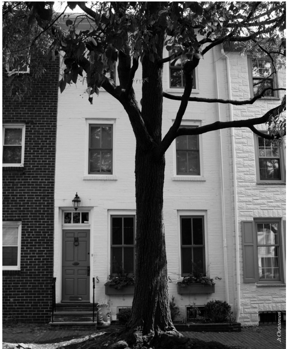
Through research a homeowner is able to find historic information on their old houses.

Once you have the list of owners, you can find other documents, many of which are online, to learn more about who owned or lived in the house, their occupations, any remodeling that was done, who the architects or contractors may have been and what uses the house may have served over time. Another city website, Open Data Philly ( www.opendataphilly.org ), lists all records that are available electronically with links to the websites. See previous issues of this newsletter and the next issue for information on how to search other records and how to learn more about property owners.