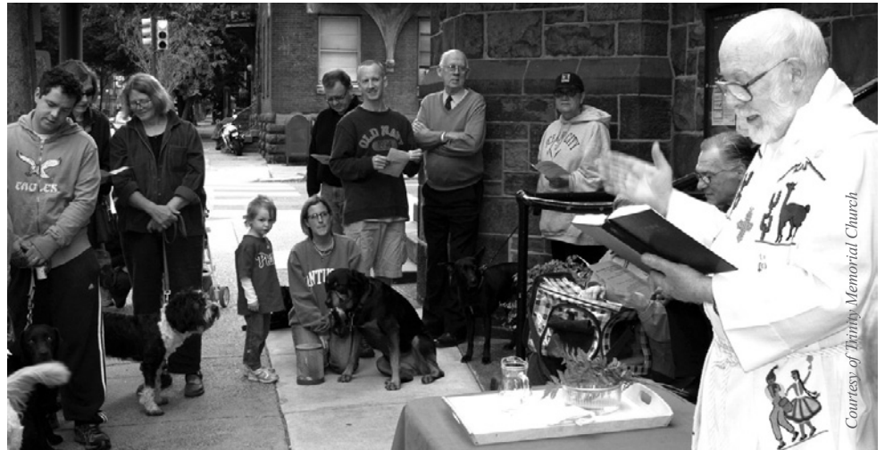
Trinity Memorial Church holds an annual Blessing of the Animals to recognize the importance of animals in our lives.