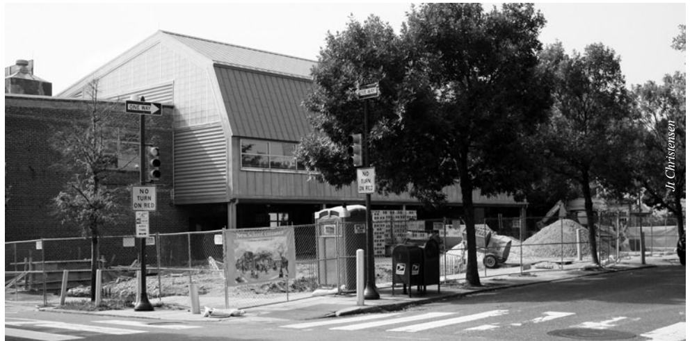
Construction began in June on the new 25th Street entryway to the Philadelphia School.