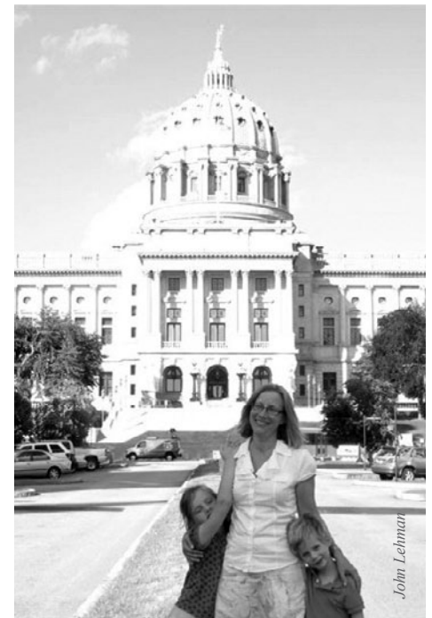
The author and her children explore the Pennsylvania State Capital from a tourist's point of view.

Back in Philadelphia, we drove a victory lap down the Benjamin Franklin Parkway. I've lived here for 12 years, but the sight of the flags flying and the yellow-faced City Hall clock still makes my heart sing. It was a great trip, but I'm glad to be back on our side of the state.