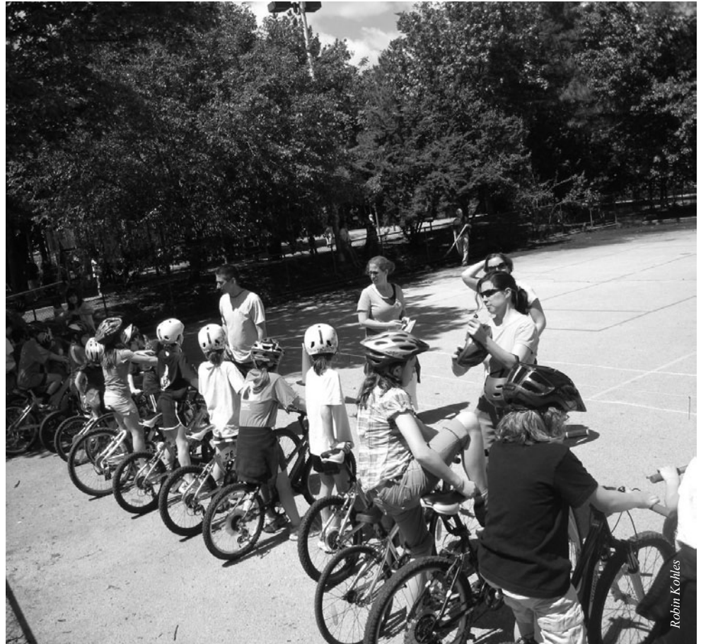
Friends of Schuylkill River Park recently offered a free Safe Routes Philly Bike Rodeo Class at Markward Playground. Participants learned the rules of the road and practiced bicycle maneuvering skills. After completing the class attendees received a free bike helmet.

organization also understands that if it is not fun, kids will not do it. TriYouthalon organizes triathlons held in the Philadelphia park system and designed mostly for children age seven and older (some races are available for ages three and older). See www.triyouthalon.org .