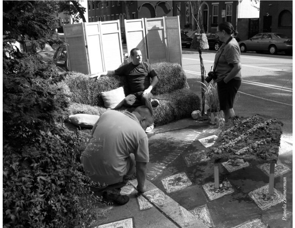
After turning a parking space into a temporary park, the team takes a rest and admires their work.

For more information, including a map of host spots, see www.parkingdayphila.org .