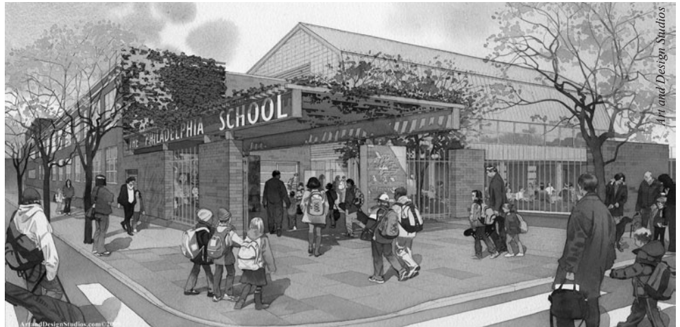
The new entryway will face a "green" play yard that will welcome students at the beginning of the 2011 school year.