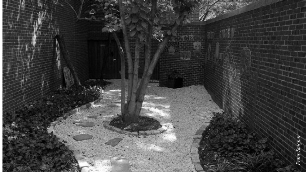
To enter the Secret Garden visitors walk on the curvilinear pea gravel path. Student tile work is on the brick wall enclosing the Secret Garden.