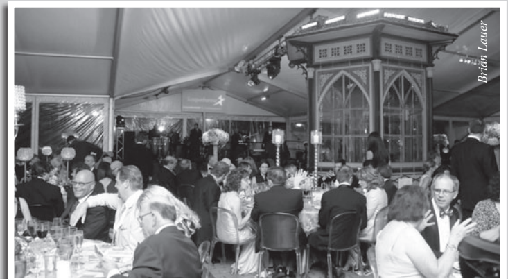
The Friends of Rittenhouse Square held the 28th annual Ball on the Square on June 16. The goal of the event was to raise $100,000 for capital improvements to the popular park.