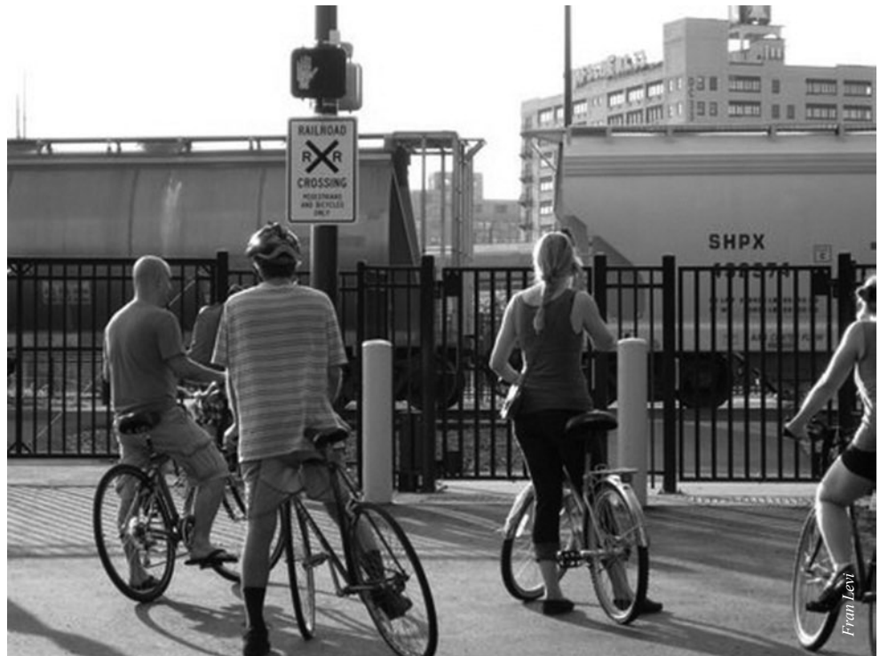
To secure the grade crossings at Locust and Cherry streets the City of Philadelphia installed electric gates that close when trains block these crossings.

temporary dog park. (Subsequent meetings with this advocacy group resulted in improvements to the temporary dog parks and a reduction in the number of trees to be removed. Visit www.riverparkalliance.org/ drupal to read the letter from Michael DiBerardinis, Deputy Mayor for